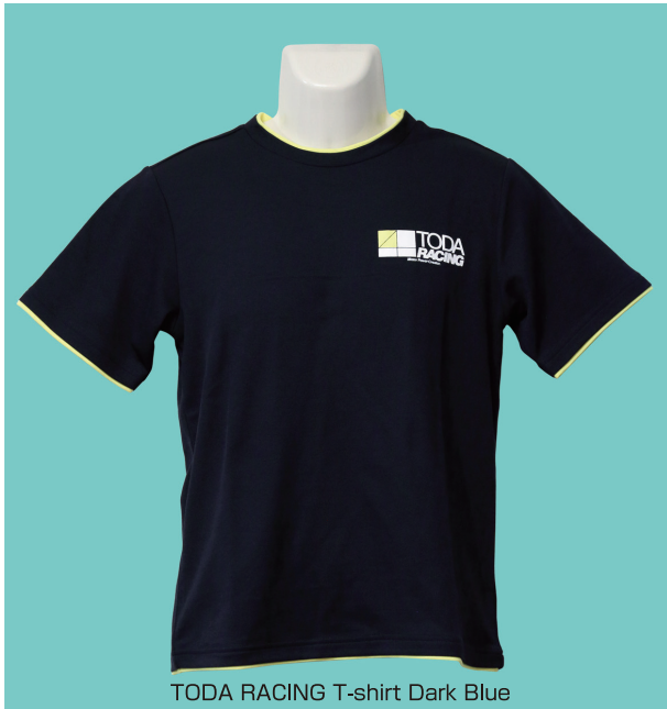
TODA RACING T-shirt Dark Blue