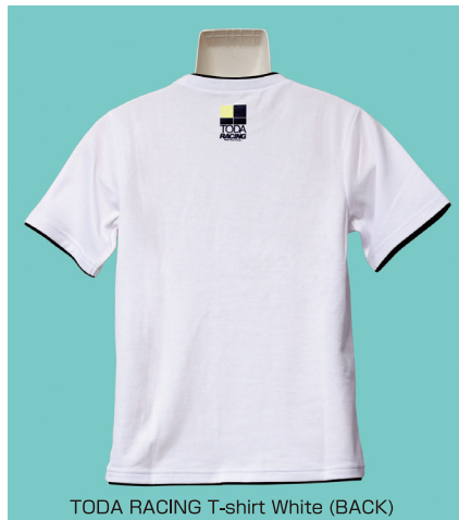
TODA RACING T-shirt White (BACK)

We are now introducing a NEW TODA design T-shirt.