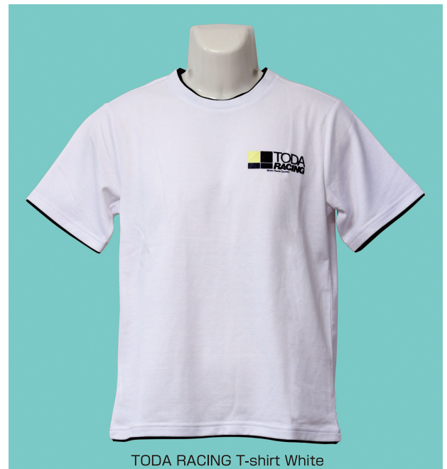
TODA RACING T-shirt White