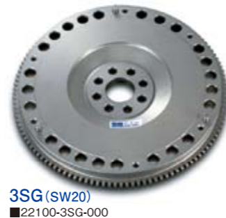
3SG (SW20) ■22100-3SG-000