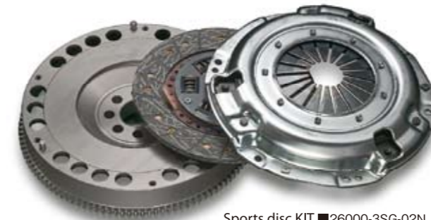
Sports disc KIT ■26000-3SG-02N