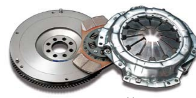
Metal disc KIT ■26000-2ZZ-00M