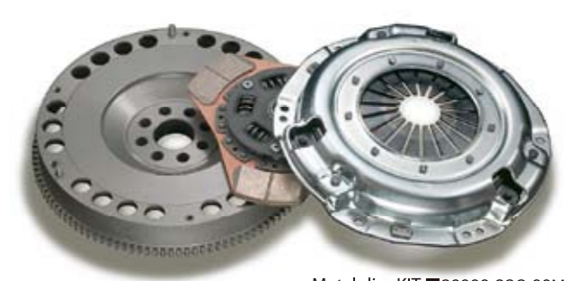
Metal disc KIT ■26000-3SG-00M