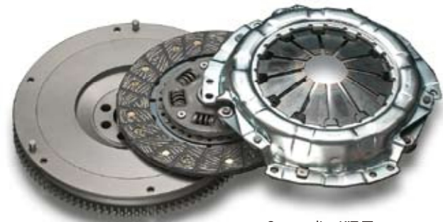
Sports disc KIT ■26000-2ZZ-01N