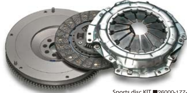
Sports disc KIT ■26000-1ZZ-01N