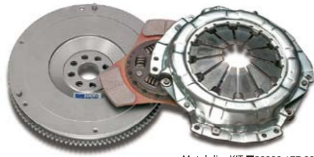
Metal disc KIT ■26000-1ZZ-00M