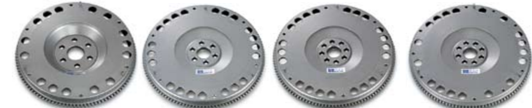
S20 ■22100-S20-000 L20-28 ■22100-L20-000 FJ20 ■22100-FJ2-000 FJ20T ■22100-FJ2-0T0