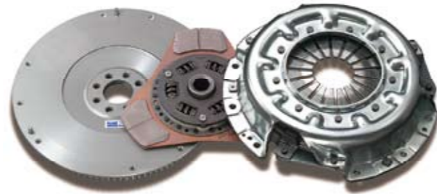
Metal disc KIT ■26000-SR2-0TM