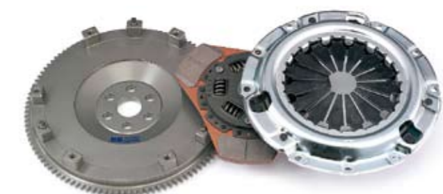
Metal disc KIT ■26000-BP0-00M

BP (NA8C/NB8C) Ultra Light Weight Chrome-molly Flywheel & Clutch KIT Set price 102,000 yen (Sports disc)/ 102,000 yen (Metallic disc)