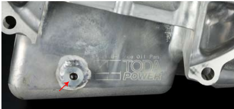
TODA Mark & Extra service hole