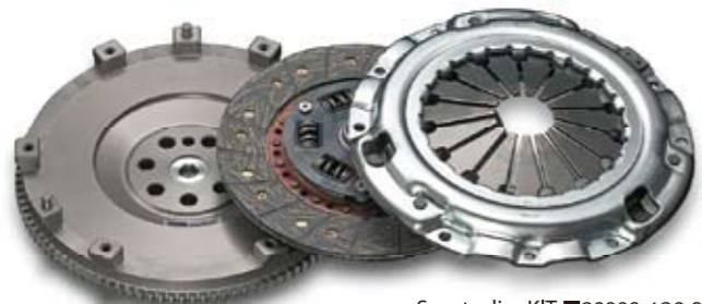
Sports disc KIT ■26000-4G6-32N