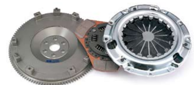
Metal disc KIT ■26000-BP0-00M

BP (NA8C/NB8C) Ultra Light Weight Chrome-molly Flywheel & Clutch KIT Set price 102,000 yen (Sports disc)/ 102,000 yen (Metallic disc)