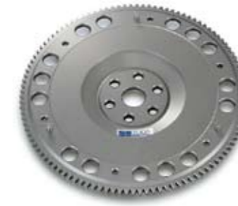
ZC 100 110 ■22100-ZC0-000