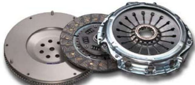
Sports disc KIT ■26000-4G6-34N