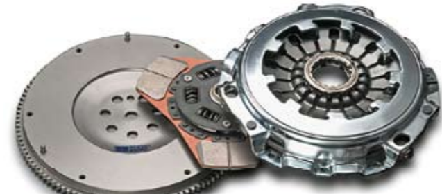
Metal disc KIT ■26000-4G6-31M