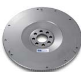
RNN14 (SR20DET) ■22100-SR2-0TP