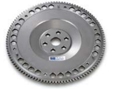
ZC 120 130 ■22100-ZC0-001