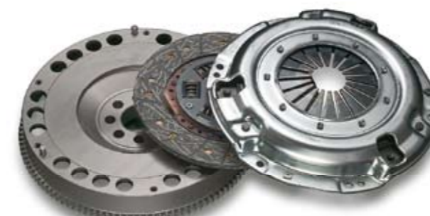
Sports disc KIT ■26000-3SG-02N