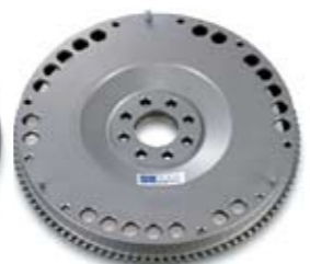
S14/S15 (SR20DE) ■22100-SR2-010