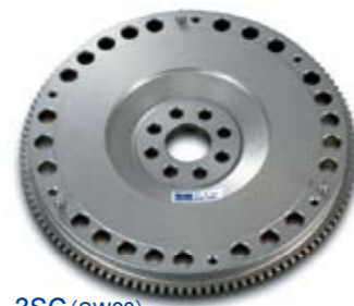
3SG (SW20) ■22100-3SG-000