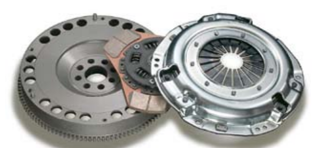
Metal disc KIT ■26000-3SG-00M