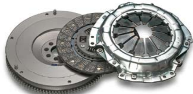
Sports disc KIT ■26000-1ZZ-01N