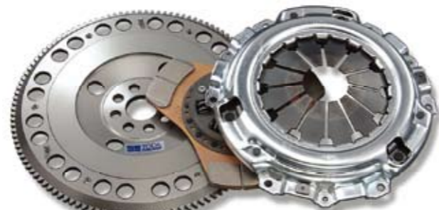
Metal disc KIT ■26000-K20-00M