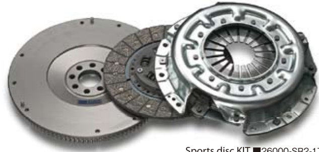
Sports disc KIT ■26000-SR2-1TN