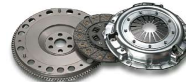
Sports disc KIT ■26000-B60-01N

B6 (NA6CE) Ultra Light Weight Chrome-molly Flywheel & Clutch KIT Set price 89,000 yen (Sports disc)/ 94,000 yen (Metallic disc)