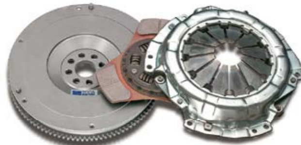
Metal disc KIT ■26000-1ZZ-00M