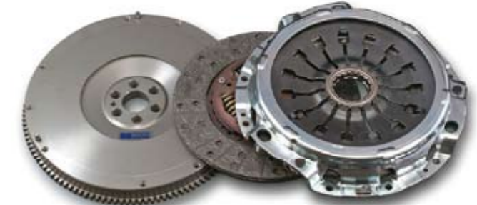
Metal disc KIT ■26000-RB2-61N

RB26DETT Ultra Light Weight Chrome-molly Flywheel & Clutch KIT Set price 102,000 yen (Sports disc) / 105,000 yen (Metallic disc)