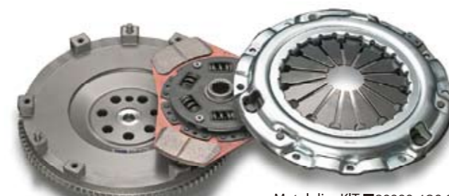
Metal disc KIT ■26000-4G6-30M