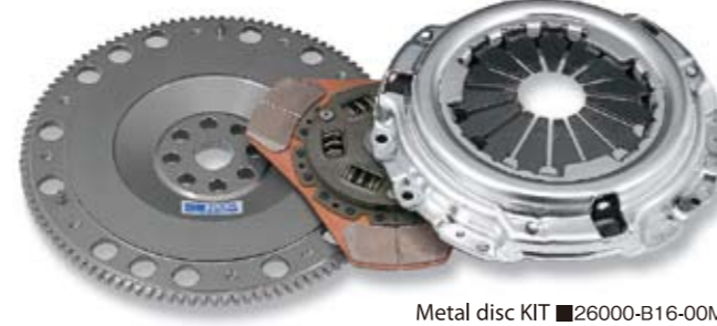
Metal disc KIT ■26000-B16-00M