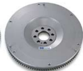
S13 (CA18DE/CA18DET) ■22100-CA1-800