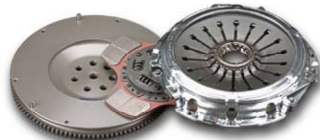
Metal disc KIT ■26000-4G6-32M