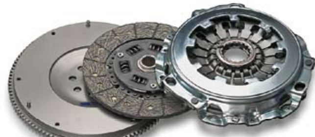
Sports disc KIT ■26000-4G6-33N