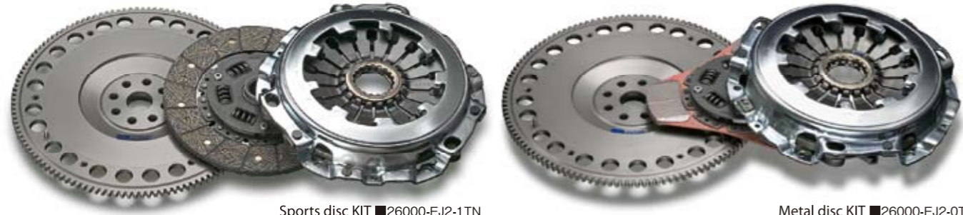
Sports disc KIT ■26000-EJ2-1TN