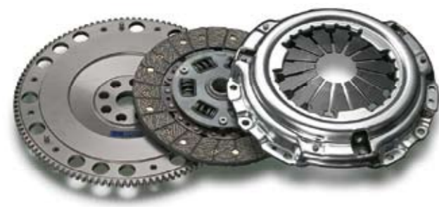
Sports disc KIT ■26000-B16-01N