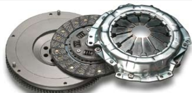
Sports disc KIT ■26000-2ZZ-01N