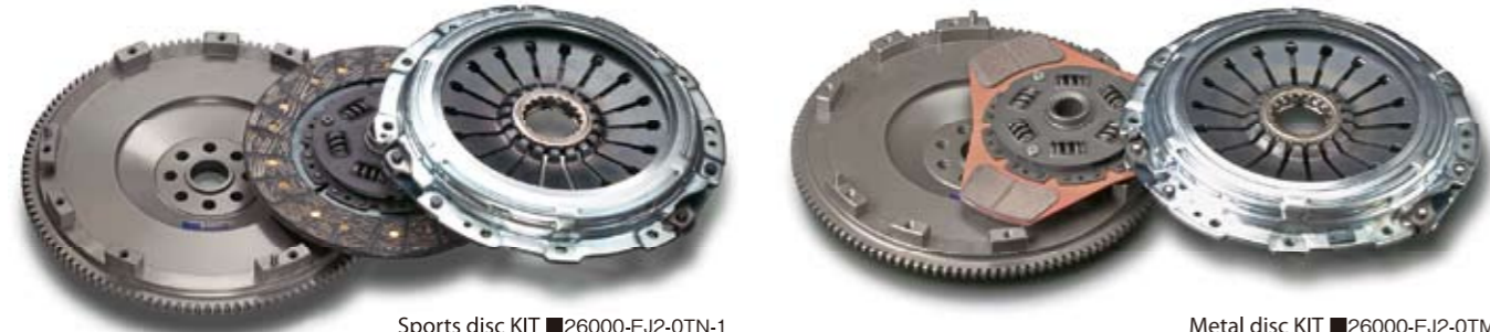
Sports disc KIT ■26000-EJ2-0TN-1