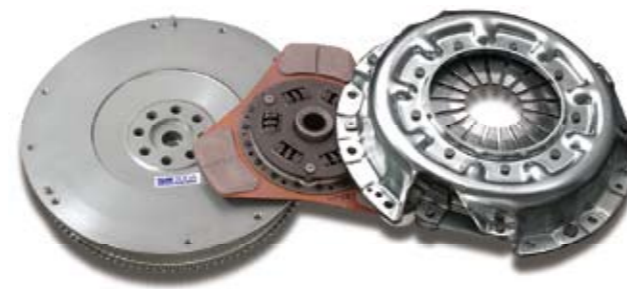
Metal disc KIT ■26000-SR2-02M