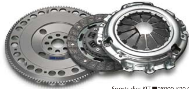
Sports disc KIT ■26000-K20-01N