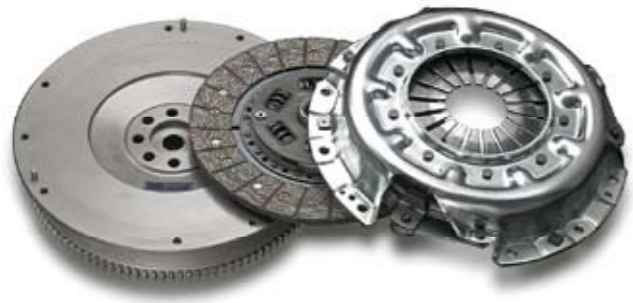
Sports disc KIT ■26000-SR2-03N