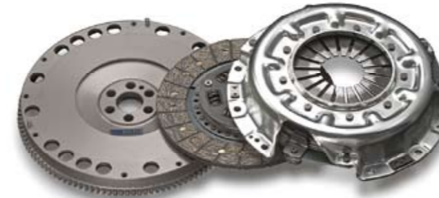
Sports disc KIT ■26000-RB2-1TN

RB20DET Ultra Light Weight Chrome-molly Flywheel & Clutch KIT Set price 102,000 yen (Sports disc) / 104,000 yen (Metallic disc)