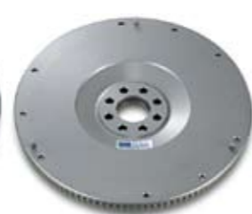
PS13 (SR20DE) ■22100-SR2-000