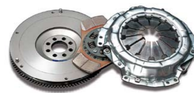
Metal disc KIT ■26000-2ZZ-00M