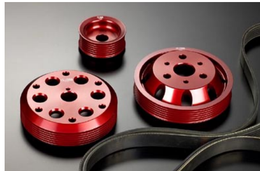
■ All pulleys are given red anodizing.

TOYOTA 86/ SUBARU BRZ FA20 Tensioner pulley & Idler pulley set List price 40,000 yen 31170-FA2-000