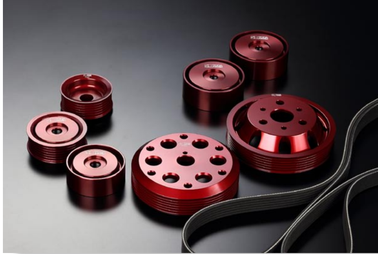
■ All pulleys are given red anodizing.

TOYOTA 86 / SUBARU BRZ FA20 Light Weight Front Pulley KIT + Idler set