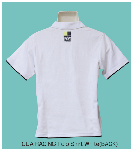
TODA RACING Polo Shirt White(BACK)

We are now introducing a NEW TODA design Polo-shirt.