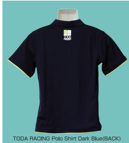
TODA RACING Polo Shirt Dark Blue(BACK)