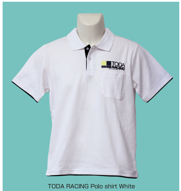
TODA RACING Polo shirt White