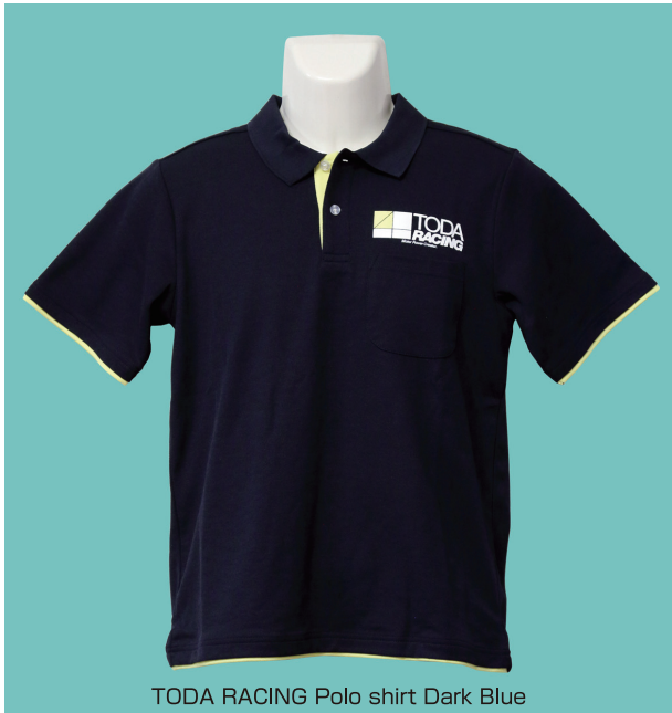
TODA RACING Polo shirt Dark Blue